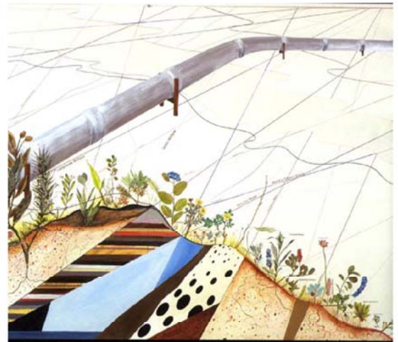
APL# 1, Asian Plants & Flowers 2003, mixed media on paper, 50 x 50 inches.

Known for his half-natural, half-scientific approach to the human-wrought decline of the natural world, Jason Middlebrook is less an environmentalist than a critic of hubris. In his latest exhibition, "The Providence," Middlebrook looked to redeem and reclaim the natural world by examining